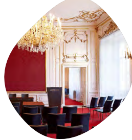
Künstlerzimmer Together with the Radetzky-Apparte- ments, this salon offers a beautiful backdrop for smaller meetings.