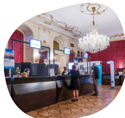
Maria Theresien APP I Named after Austria's most famous regent, this historic room will be available for our symposia sessions.