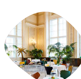
Marmorsaal In combination with other rooms, the Marmorsaal will be one of our networking spaces.