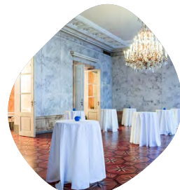
Antekammer In combination with other rooms, the Antekammer will be one of our networking spaces.