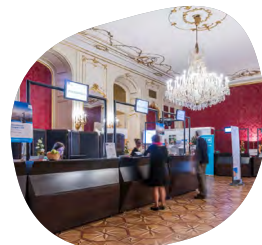
Maria Theresien APP I Named after Austria's most famous regent, this historic room will be available for our symposia sessions.