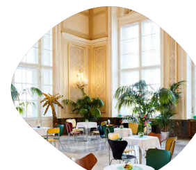
Marmorsaal In combination with other rooms, the Marmorsaal will be one of our networking spaces.