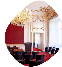
Künstlerzimmer Together with the Radetzky-Apparte- ments, this salon offers a beautiful backdrop for smaller meetings.